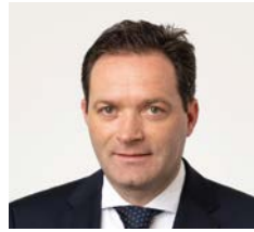
Norbert Totschnig Federal Minister of Agriculture and Forestry, Climate and Environmental Protection, Regions and Water Management

” The unique holiday experience that can be enjoyed in the Austrian Alps is based on the hard work and traditions of our mountain farmers. Ten clear rules can improve safety and help to avoid conflicts. We want to ensure that farmers and their families can earn a living and that guests can enjoy their holidays. “