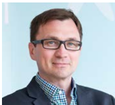
Gerald Dunkel-Schwarzenberger President of Verband alpiner Vereine Österreichs

” Austria’s alpine pastures and meadows represent a deep closeness to nature and important economic areas, also in tourism. The unique landscape delights countless visitors every year, offering a wide range of holiday and leisure activities. Through mindful collaboration we can preserve this treasure and sustainably strengthen value creation in the regions. “